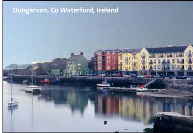
Dungarvan, Co Waterford, Ireland

No refunds will be made in respect of non-attendance without prior cancellation.